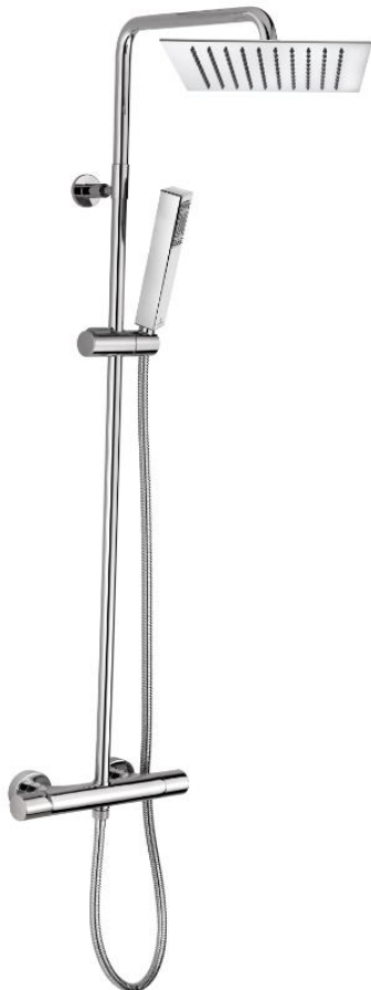
Immagine Prodotto - Product Image

настенная колонна из латуни Ø 20 мм – Душ TETIS 300x300 мм - CUBE Ручная лейка - держатель для лейки поворотный - Шланг латунный дв.фальцевания 150 см 1/2" FF конус - Смеситель термостатический с встроенным переключателем