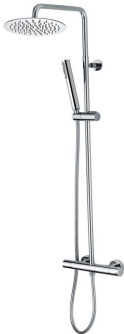
Immagine Prodotto - Product Image

настенная колонна из латуни Ø 20 мм – Душ TETIS Ø300 мм - ZEN Ручная лейка - держатель для лейки поворотный - Шланг латунный дв.фальцевания 150 см 1/2" FF конус - Смеситель термостатический с встроенным переключателем